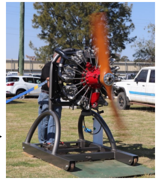
Circuit race cars ▲ radial engine running ►