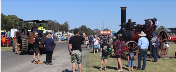
Model-T ford ▲ Steam traction engines▼ agricultural equipment ▼